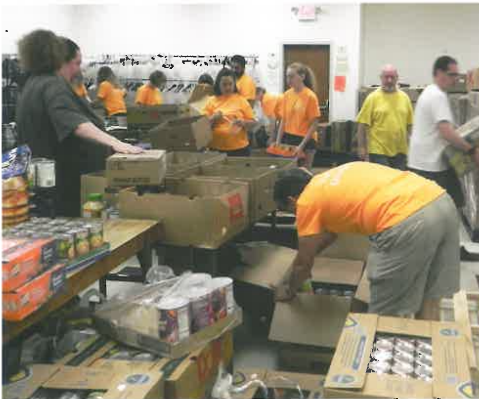
Vanguard exceeded its goal of 500 tons of food for area pantries such as ours and raised a record 540 tons of food!